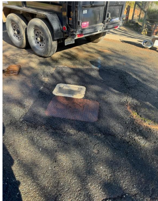
Replaced meter box cluster on Konocti Dr